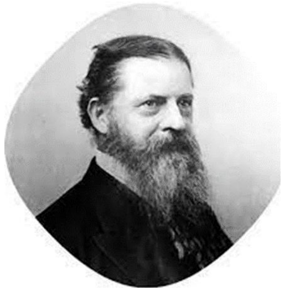
Charles Sanders Peirce

Some might doubt this lofty view of Peirce. Others might admire him for this or that contribution yet, overall, hold an opinion of his oeuvre similar to that expressed by the psychologist William James on one of his lectures, that it was like ‘flashes of brilliant light relieved against Cimmerian darkness’. Peirce might have good things to say, so this