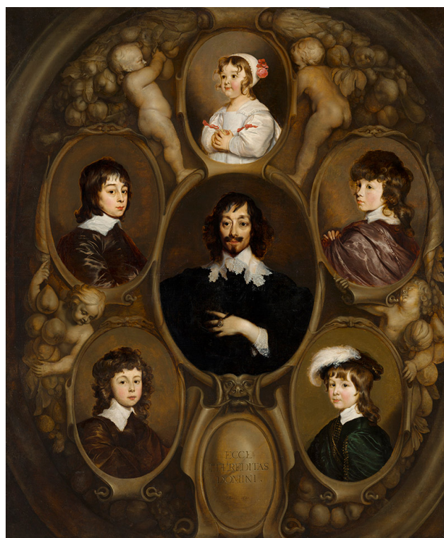
Portrait of Constantijn Huygens and his Five Children (1640) by Adriaen Hanneman. Christiaan is depicted top right.

On a diplomatic posting to London in 1621, he met a fellow Dutchman, the inventor Cornelis Drebbel, and acquired from him a camera obscura that, he wrote, projected images of such beauty, it promised to make ‘all painting ... dead in consequence’. In 1635, he would attempt to assist René Descartes, then living in Holland, in the task of making a hyperbolic lens (a lens of a form that it was thought might overcome the spherical and chromatic aberration that frequently marred the quality of images projected through early telescopes). Despite several attempts to draw the precise curve for the lens grinder to work to, that project was a failure. Shortly after this episode, however, Huygens was able to offer help of a kind that he was more familiar with by arranging for the publication of Descartes’s landmark work of philosophy, Discours de la méthode (1637), in Holland and France.